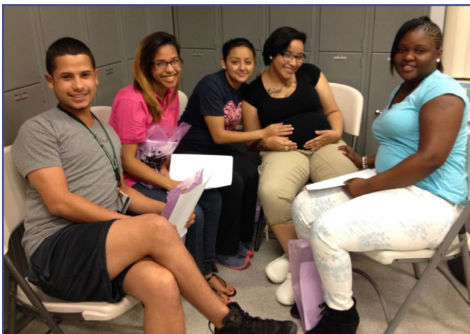
Teens Participating in Hartford Job Corps’ 2013 Cupcakes and Condoms Event

Another HTPPI partner in reaching adolescents has been Capital Workforce Partners (CWP), one of Connecticut’s five regional Workforce Investment Boards.