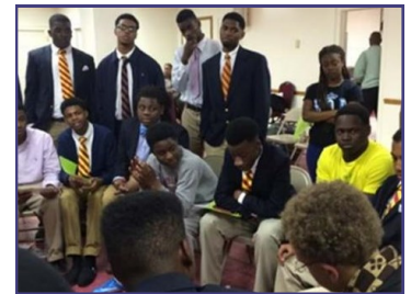
Kappa League Members & Alumni

Community activities focus on enhancing male engagement through: (1) a high school-based Fatherhood Initiative and