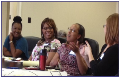
Mobile County Community Partners

The Mobile County Health Department (MCHD) has adopted the collective impact process to mobilize community organizations and service providers around adolescent health and teen pregnancy prevention. The collective impact process requires community partners to have a shared vision for change based on a common understanding of the issue and to develop a collaborative, mutually reinforcing approach to solving it.