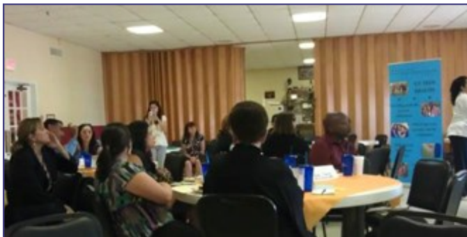
Core Partner Leadership Team