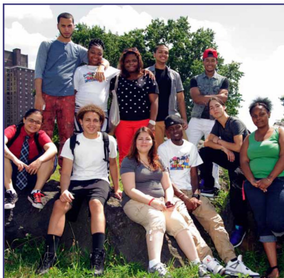
Bronx Teens Connection Youth Leadership Team