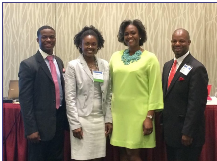
Members of the MCHD & Kappa League