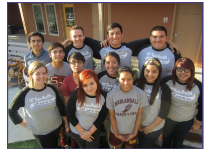
UT Teen Health Youth Leadership Team

Continue bimonthly Youth Leadership Team (YLT) meetings and activities including the development of a “mobile” YLT for special populations such as youth in the juvenile justice system and foster care.